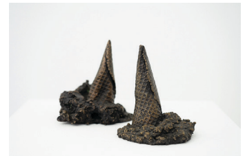
Jason Meadows, Ice cream cone , 2019. Bronze. Dimensions variable.

Gallery address: 716 Sacramento St. San Francisco, CA 94108