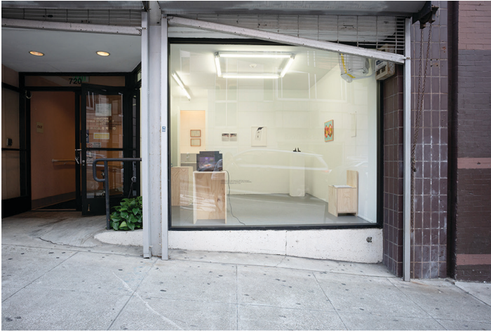
Installation view from gallery storefront.