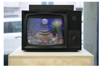
Carl Cheng, Alternative TV #5 , 1974. Chassis, water tank, air pump, LED lighting and controller, electrical cord, aquarium hardware, conglomerates rocks, plant. 14 x 13 x 8 in.

Friday, September 13– Friday, November 25, 2019